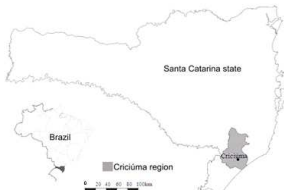
Fig. 1: Studied area of arthropods bites and stings. Map of Brazil with the location of Santa Catarina state and Criciúma region

Criciúma region (Fig. 1) is the socioeconomic province composed by folloing 11 municipalities: Içara, Lauro Müller, Morro da Fumaça, Nova Veneza, Siderópolis, Urussanga, Forquilha, Cocal do Sul,