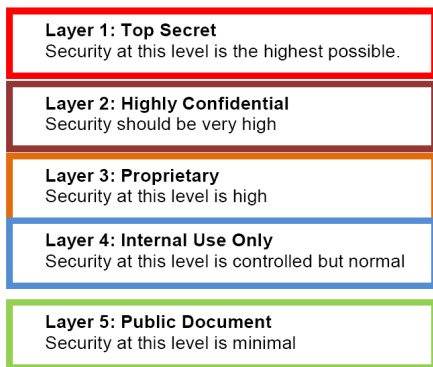
Fig. 2: Examples of multilayered structure

The top layer represents the most sensitive information, while the lowest layer represents the lowest sensitive information. We could adopt this characterization concept of information classification to classify online communication. Then, we can organize