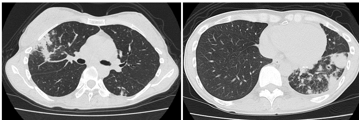
Fig. 1: Chest CT on admission showing an infiltration shadow with bronchiectasis in the right upper lobe and left lower lobe. (Case 1)

GGO: Ground Glass Opacity, N.D.: Not Done, TMP/SMZ: Trimethoprim-Sulfamethoxazole, LVFX: Levofloxacin, AMK: Amikacin, IPM/cs: Imipenem/ilastatin, MINO: Minocycline