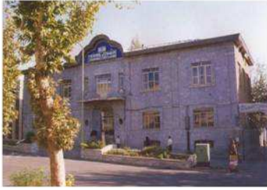
Fig. 5: Municipality of the city

A group of canalizations were done in the “Sardnoy” Plains (the present military base) on the west of Sanandaj for the Court of Justice.