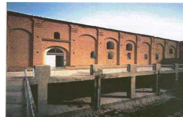
Fig. 3: Church of Sanandaj