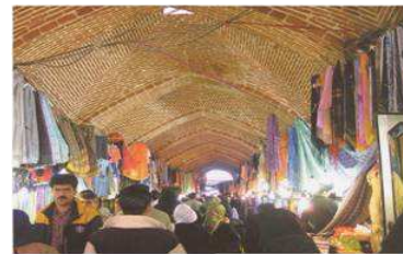
Fig. 2: The Bazaar

Sanandaj started with the fort or the village on its south, but when the capital got transferred from Hasanabad village to the south of the present Sanandaj, it became the domicile for the Kurdistan governor (Soleiman Khan Ardalan) who renovated and expanded it in 1667. In an ancient inscription, the name of the city at the time of becoming the domicile of the governor, which is also considered as the time of its expansion and prosperity, is recorded as "Ghamha". Mardukh (1972) calls searching for such words in an attempt to find the historical name, date of creation and establishment of the city, as opposing to wisdom and theosophy (Mardukh, 1972, quoting Gazrani). According to the written information, the city of Sanandaj next to the village of "Sineh" with 20 meters of height and overlooking the surrounding lands, was built in 1686 by Soleiman Khan the governor of Kurdistan to serve as a political center for military purposes and to home a handful of Feudalistic households, during the reign of King Safi. This fort is now known also as Ferdowsi Fort and Officers' Club. Later, many buildings such as bathrooms, mosques and bazaars were also built in different scale around it (Fig. 1-5).