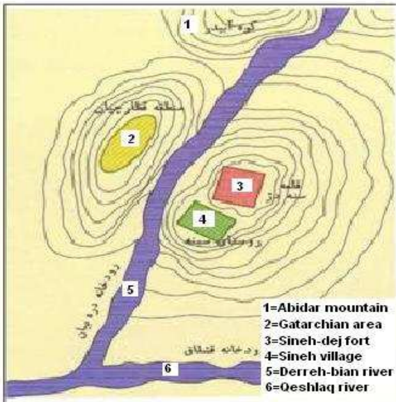
Fig. 1: The old core and location of Sanandaj

The connection of this city and its adjacent regions with Arian legendary heroes, speaks of its importance and antiquity. This city is situated on a large hill along the Qeshlaq River called "Pialeh Toosh Nowzar". Its geographical situation is confirmed as a safe and defendable place (Najafi, 1990).