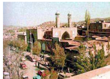
Fig. 4: Jami Mosque