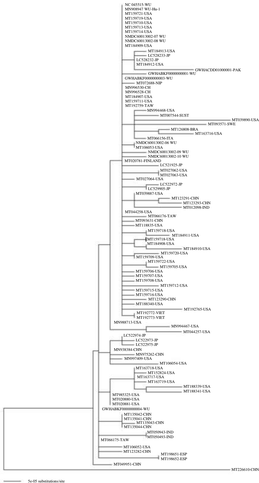
Fig. 3: ML phylogenetic tree constructed by the dataset using the modeltest GTR + I + G