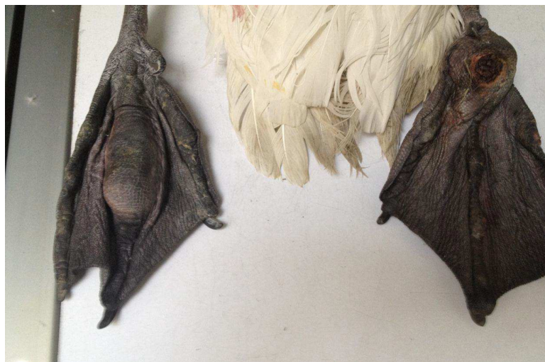
Fig. 1: Bumblefoot in a Mute Swan

After 14 days of treatment with Clindamycin a second blood sample revealed a normal Complete blood count and wound healed successfully. It was suggested to owner to use softer substrate and enforce more time on the water to avoid recurrence of FPD.