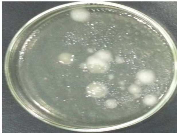
Fig. 5. The antifungal effect of Clove oil against C. albicans ; recovered from human, at a concentration of 4% showing constricted growth of the colonies appeared after the 4th day of incubation