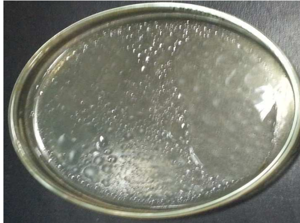
Fig. 4. The antifungal effect of Thyme oil against A. fumigatus ; recovered from cattle, at a concentration of 0.25% showing complete inhibition of the growth