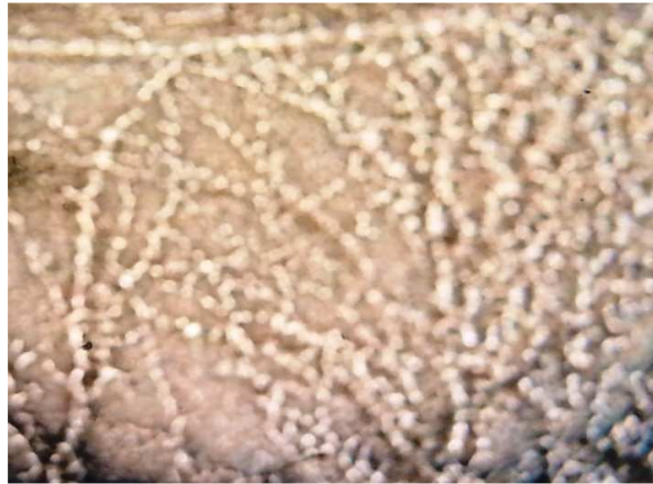
Fig. 1. Chlamydospore production on rice agar medium under microscope yeast cells appear as spherical clusters at regular intervals on pseudohyphae and having the chlamydo-spores on the pseudohyphae like shiny pearls