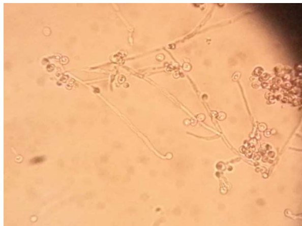
Fig. 2. Germ tube formation of C. albicans under microscope. Germ tubes appear as hypha-like extensions of yeast cells, produced usually without a constriction at the point of origin from the cell