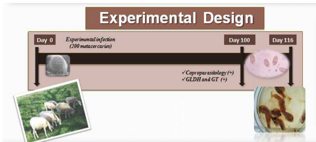
Fig. 3. Experimental Design: At day 0, each lambs free of parasites were infected orally with 200 metacercariae of F. hepatica contained in a gelatin capsule. The infection was confirmed 14 weeks later (Day 100 pt.) by the presence of eggs in feces and the indirect estimation of liver damage was determined by measuring the levels of the serum enzymes GLDH and GT. The adult flukes were collected of the bile ducts and liver (Day 116 pt.)