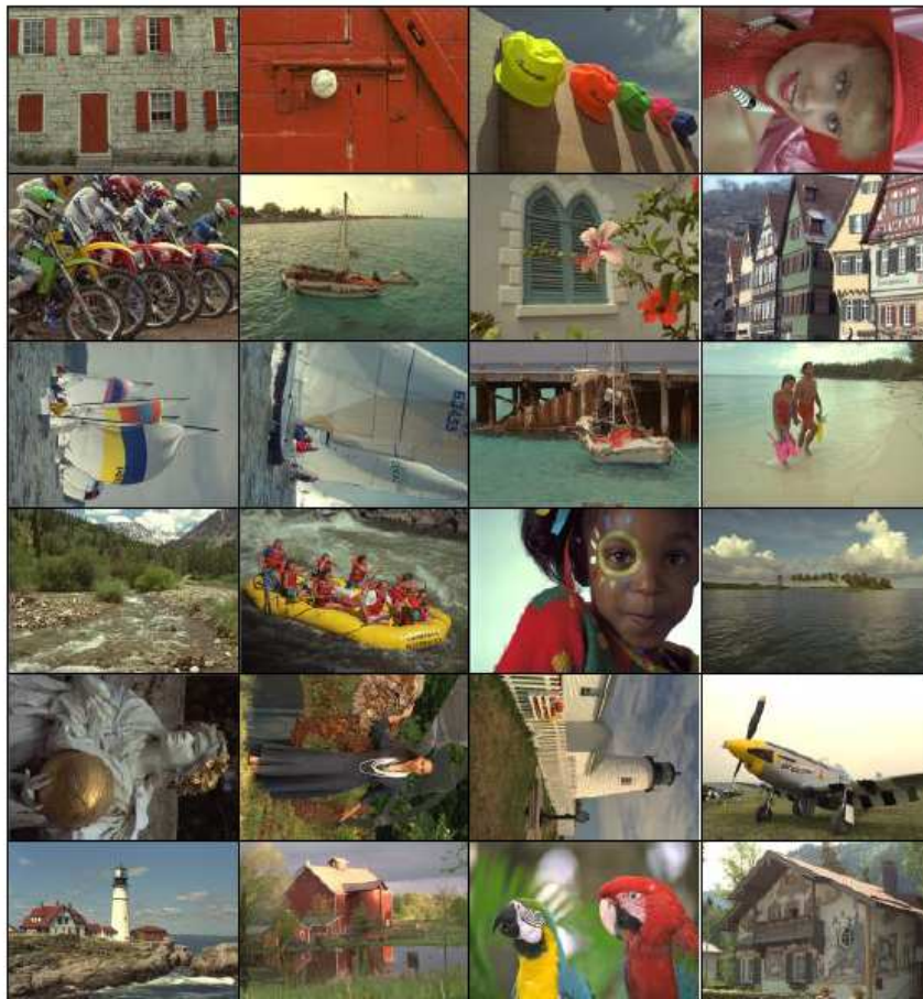
Fig. 4. Set of 24 bit tested images (images are numbered from 1 to 24 in the order of left-to-right and top-to-bottom)